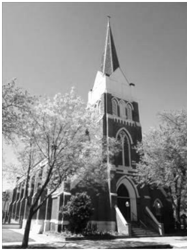
St. Joseph' Mission