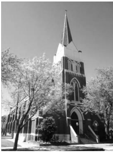
St. Joseph' Mission