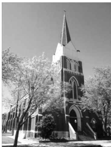
St. Joseph' Mission