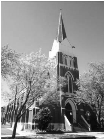
St. Joseph' Mission